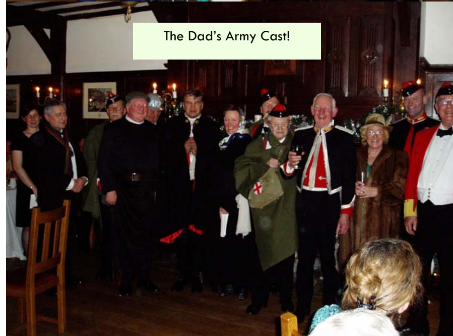
The Dad's Army Cast!