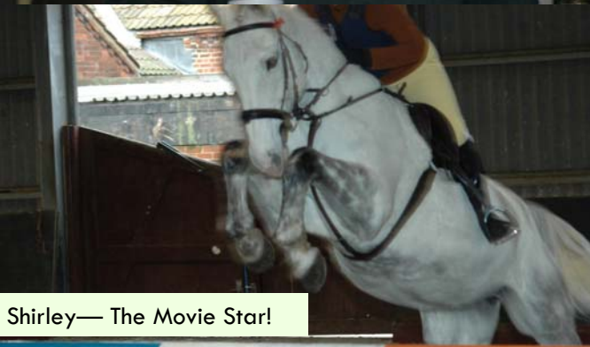
Shirley— The Movie Star!