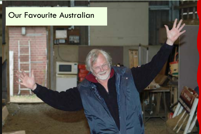
Our Favourite Australian