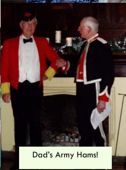
Dad's Army Hams!