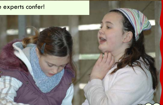
The experts confer!