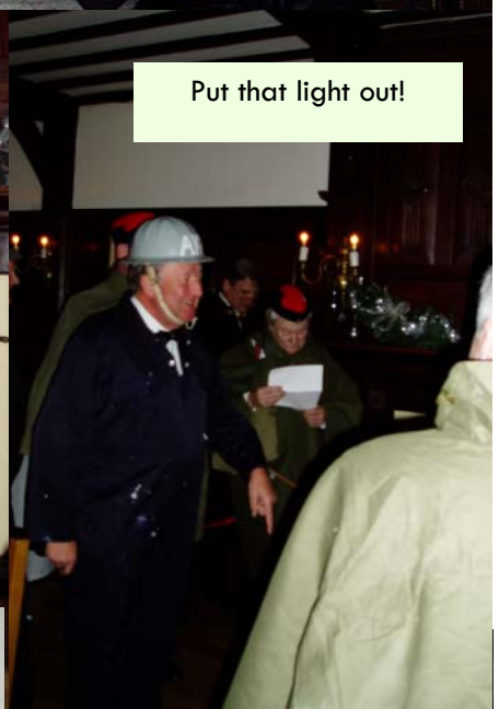
Put that light out!