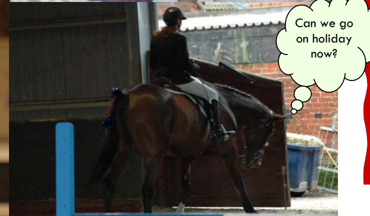
Can we go on holiday now?