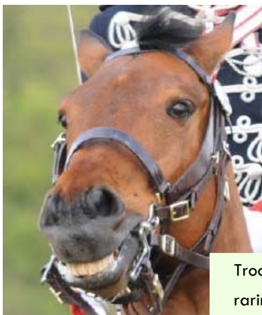
Trooper Bob raring to go!